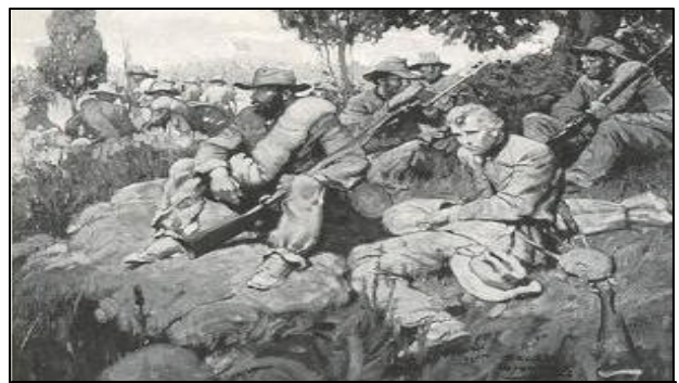
The Confederates Rest