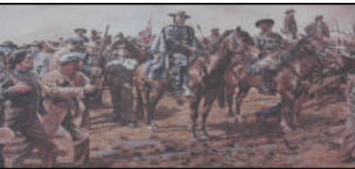
Hood and the army retreats

The broken and defeated Confederate Army of Tennessee finishes crossing the Tennessee River as General John Bell Hood's force