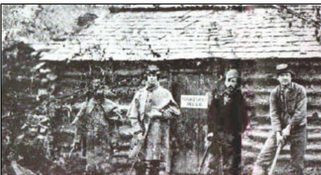
Texans on picket duty on the Potomac River December 1862

retreats into Mississippi. After crossing the Tennessee River, Hood reported 18,708 officers and enlisted men, a figure that another Confederate general, Pierre Beauregard, thought was significantly inflated. The army had more than 30,000 men when it had entered Tennessee the month before. The Confederate Army of Tennessee was no longer a viable fighting force.