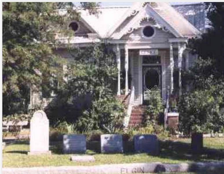
The Glenwood Cemetery Office and Elgin Plot Washington Avenue, West of downtown